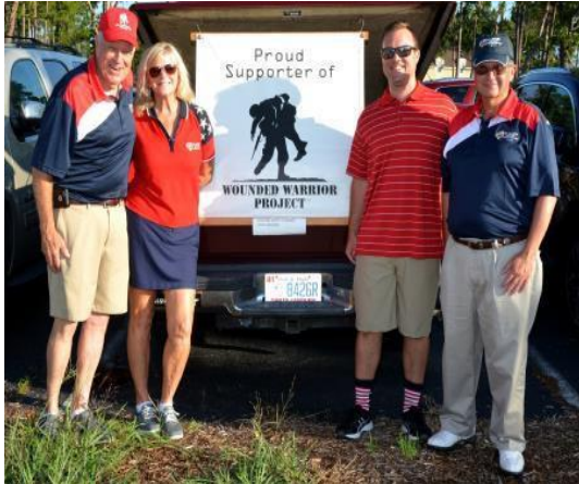
Wounded Warrior Golf Ball Donations