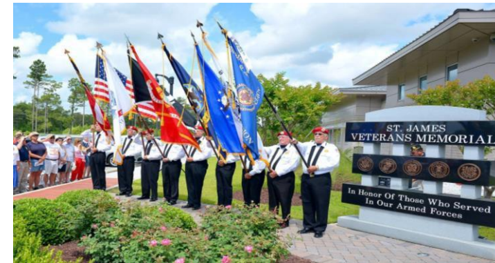
Memorial Day & Veterans Day Ceremonies