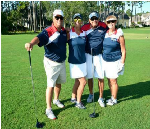
Foursome Enjoying Tournament