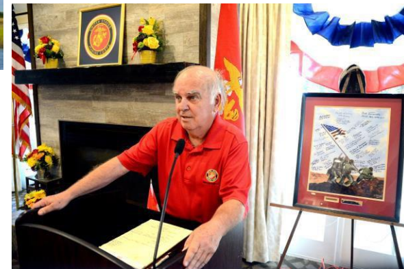
Marine Golf Tournament