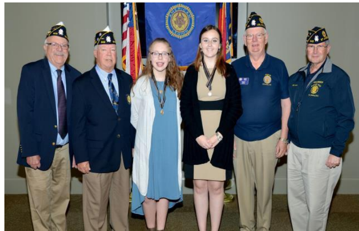
Legion Oratorical Contest