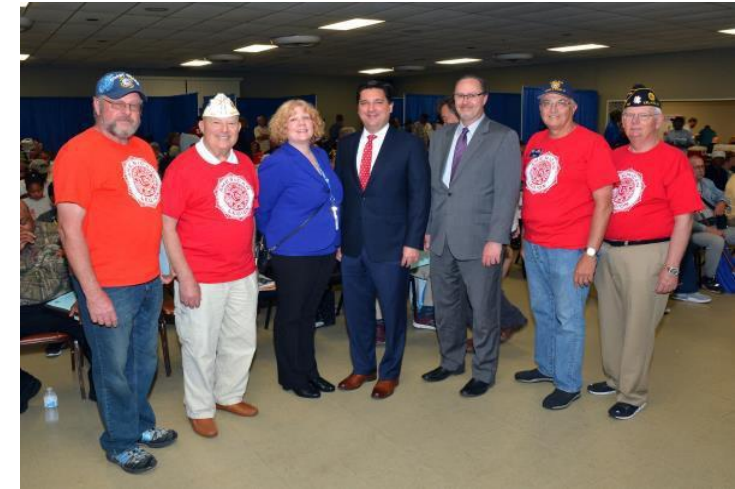
Veterans Experience Action Center