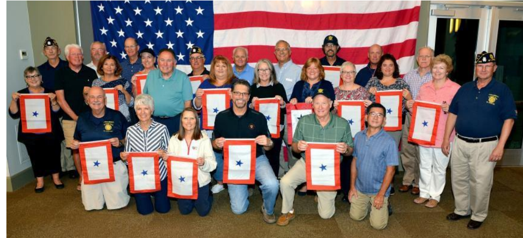
Blue Star Families