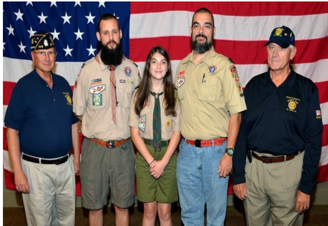
National Youth Leadership Training Scholarship