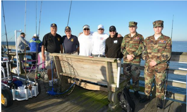
Wounded Warrior Pier Fishing