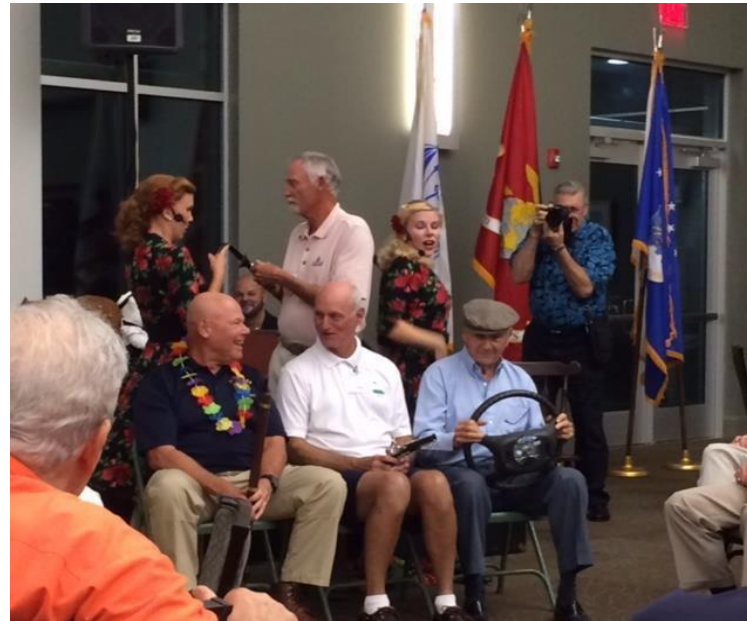
Letters From Home Show