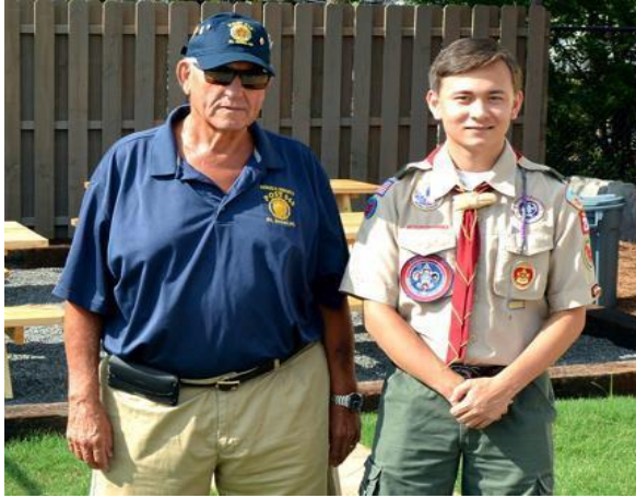
Eagle Scout Project Assistance