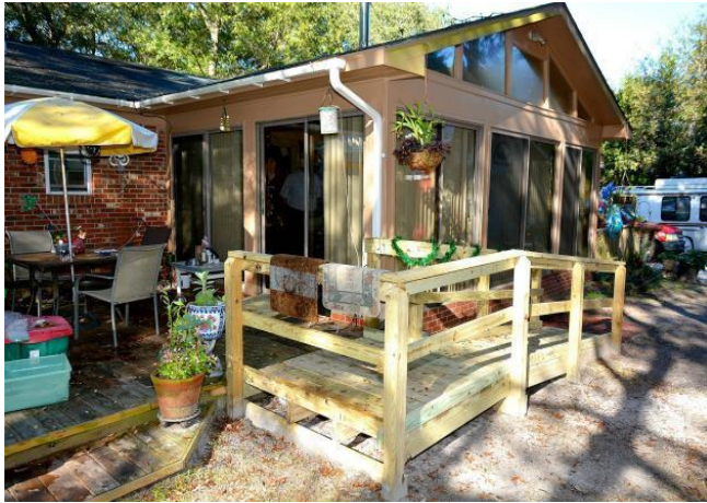
Ramp Built for Disabled Veteran