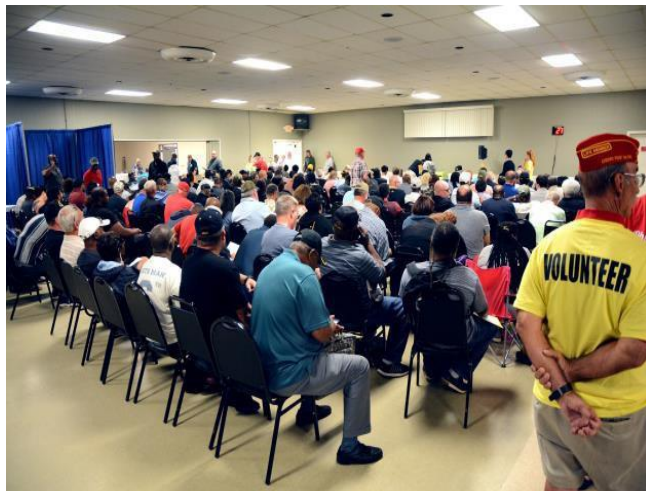
Veterans Experience Action Center