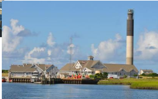
US Coast Guard Station Oak Island