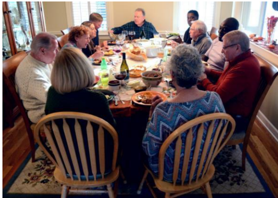
Hosting Marines At Thanksgiving