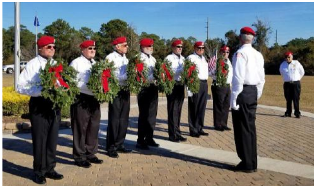
Wreaths For The Fallen Ceremony