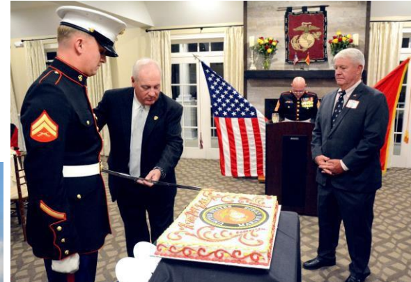
Marines Birthday Party