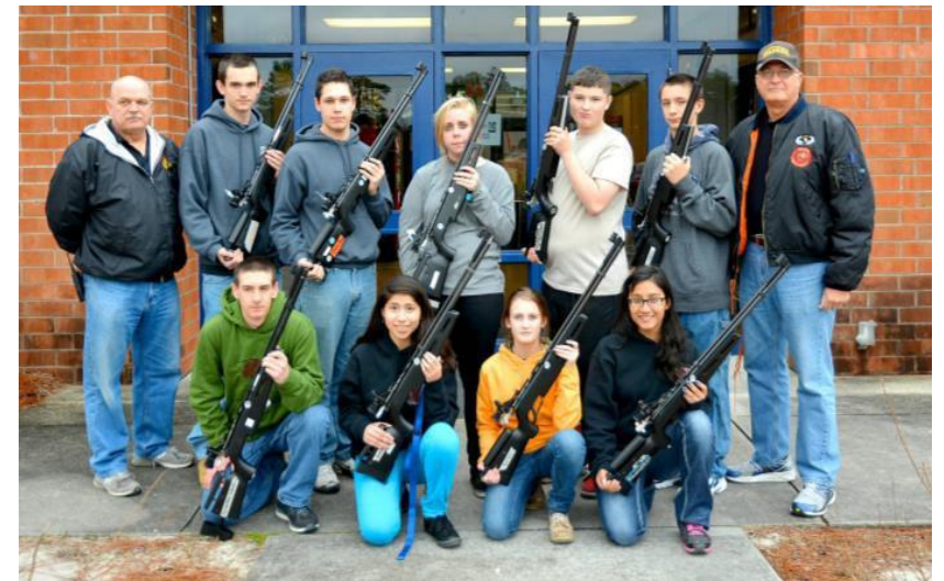
SBHS JROTC Shooting Team