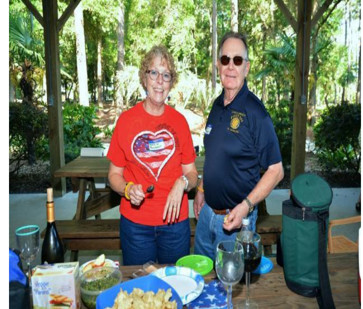
Post Picnic At Waterway Park