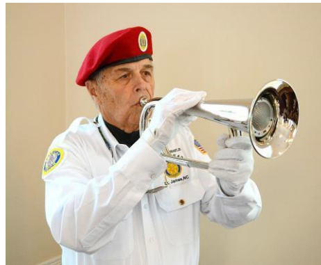
Conducting Funeral Honors