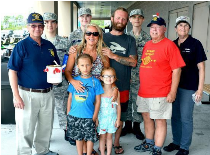
Poppies Donation Campaign