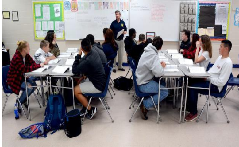
Teaching SBHS JROTC Classes