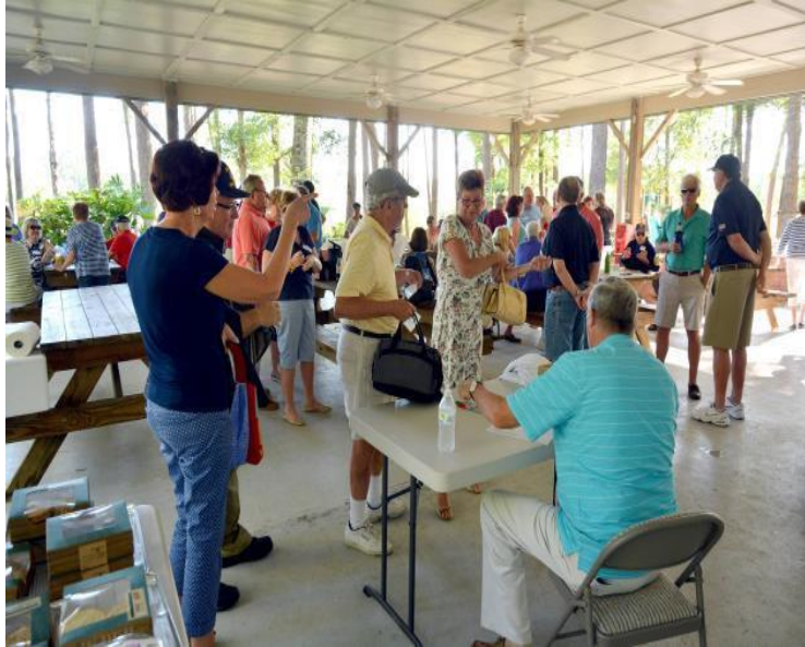
Post Picnic At Waterway Park