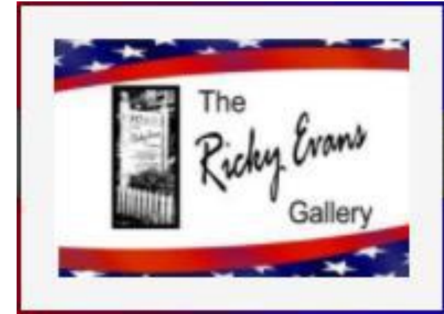
Business Donor Banner