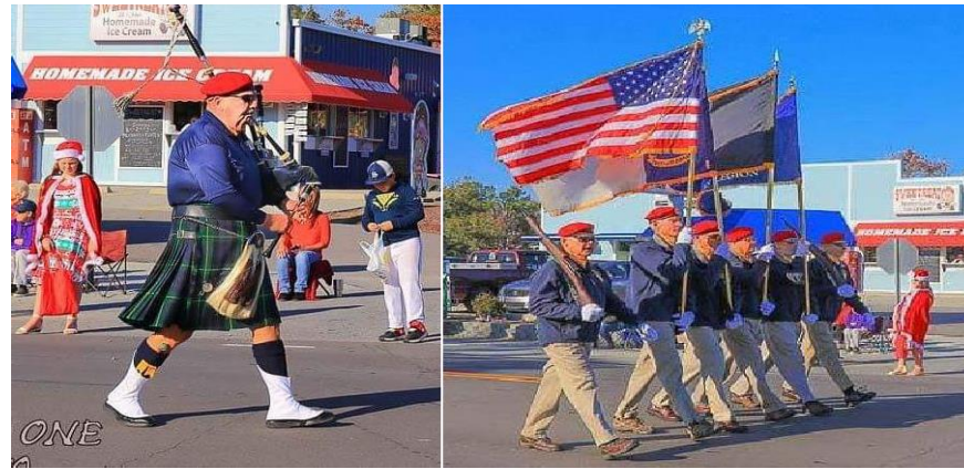
Marching in Local Parades