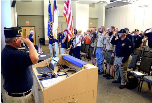
Posting Colors For Monthly Meeting