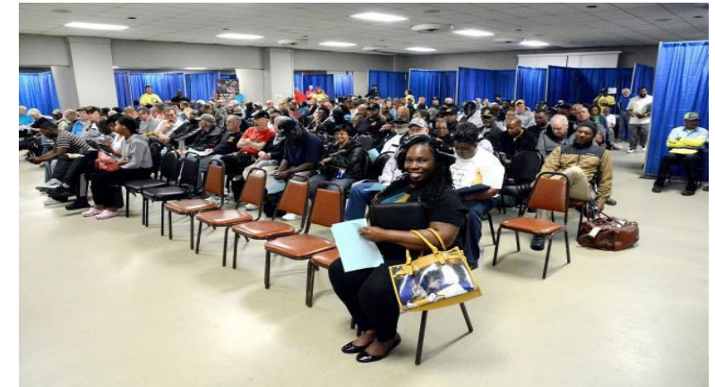
Veterans Experience Action Center