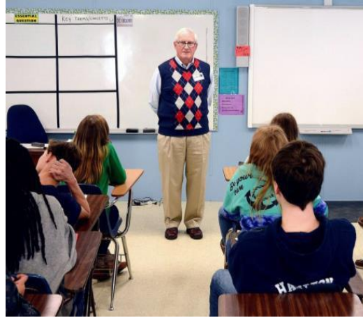
Teaching At South Brunswick Middle School