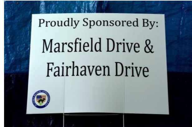
Neighborhood Tee Sign